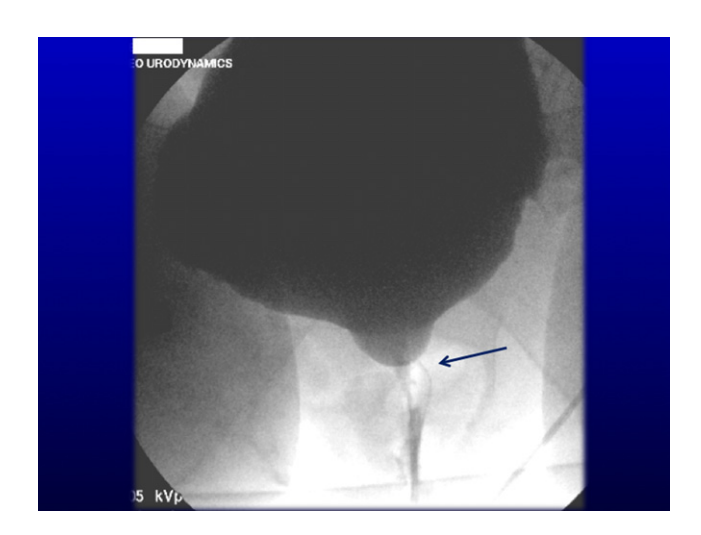
Figure 2. Cystogram with mid urethral stricture

Smith et al described a series of 7 women with urethral strictures who received dilation to 30Fr, followed by clean intermittent catheterization. During the 6 to 34-month followup 3 of 7 women required multiple repeat urethral dilations, although they achieved a significant 10-point improvement in the American Urological Association symptom score. Massey and Abrams reported a 76% cure rate for women without detrusor overactivity and an intramural cause of obstruction, including stricture.8 The success rate of each treatment (catheterization, dilation or urethrotomy) was not described. In an early report of internal urethrotomy the only 2 females included had a successful outcome.9 To our knowledge there are no reports of head-to-head comparisons of these different procedures in women.